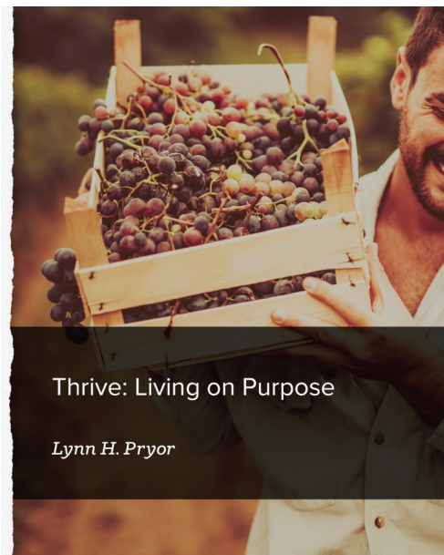
Thrive: Living on Purpose